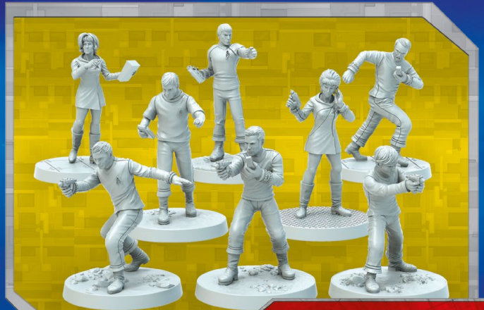
32MM MINIATURES THE ORIGINAL SERIES