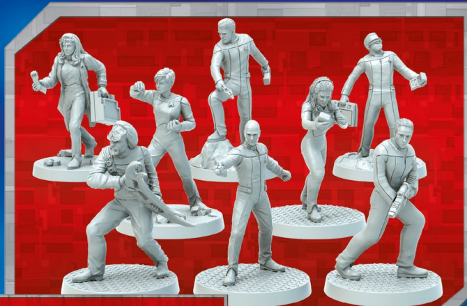
32MM MINIATURES THE NEXT GENERATION