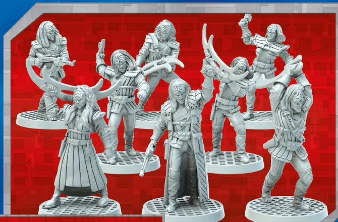
32MM MINIATURES KLINGON WARBAND