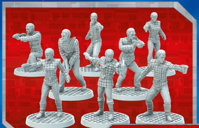
32MM MINIATURES ROMULAN STRIKE TEAM

ENHANCE YOUR ADVENTURES WITH SETS OF EIGHT 32MM HIGH QUALITY RESIN MINIATURES PLUS GEOMORPHIC FLOOR TILES TO RECREATE SHIPS, SPACE STATIONS, LOST COLONIES, AND ANCIENT RUINS!